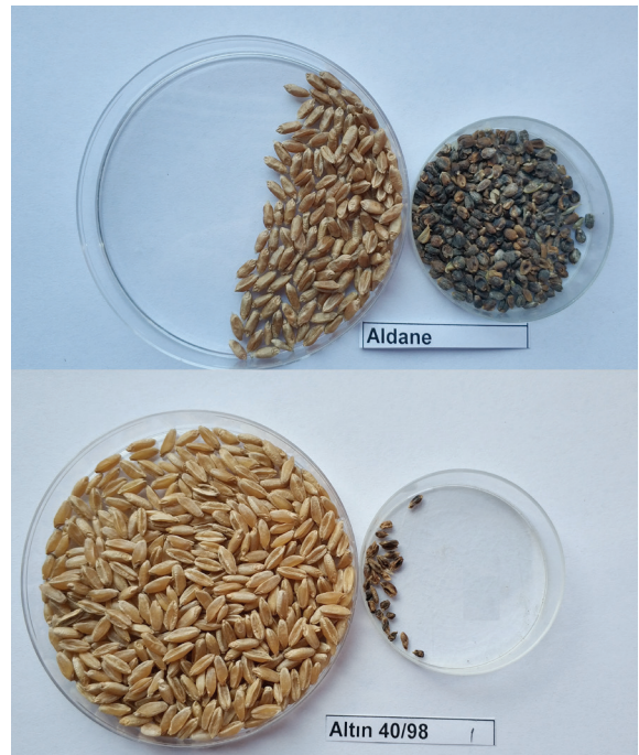
Figure 2. Healthy wheat grains and grains converted into galls, bread wheat cv. Aldane and durum wheat cv. Altın 40/98

Parveen et al. (2003) tested the effects of wheat gall nematode against 7 bread wheat varieties and showed that of these, HD-2009 and WH-542 varieties were resistant to the nematode. Furthermore, they established that even if infected grain formation was not observed in these varieties, curling and twisting were observed in the leaves, which are important signs of nematode damage. From the results of their study conducted in pots and tubes, they proposed that HD-2009 and WH-542 can minimize the effect of wheat gall nematode.