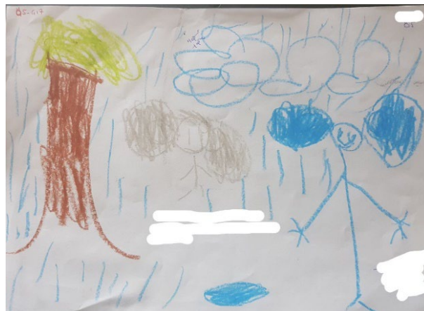
Figure 3. C17's drawing

In the second category, adding unusual features to objects or people was another way that the children created humour, with some of the children making absurd changes in terms of the colour, shape, size or number of something, as illustrated in the drawing below.