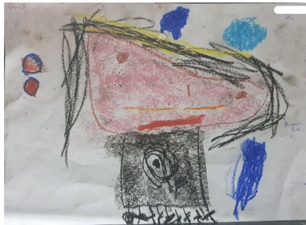
Figure 2. C13's drawing

There is a weird girl with a moustache. She also has more than one leg and a bottom on her belly. This is funny.