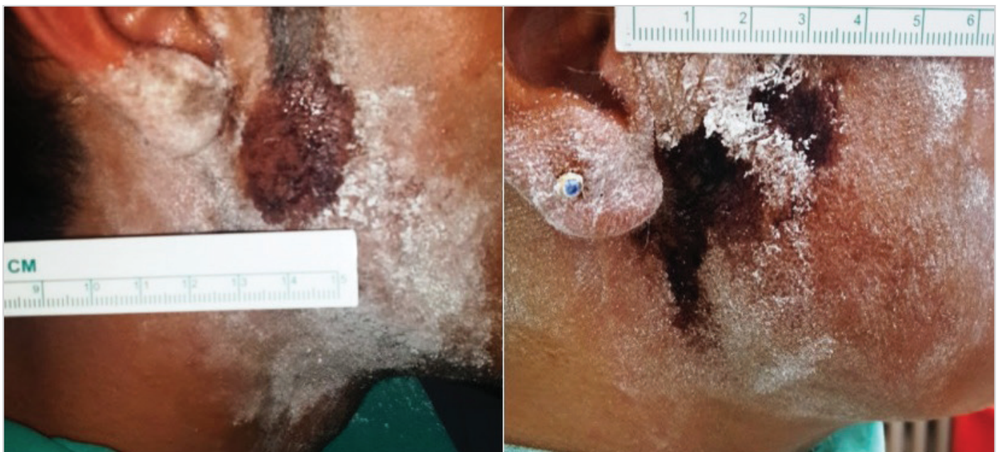
Figure 2. Samples of patients with FS 20 min after sialogogue administration, which shows colored areas and represent a positive Minor's test

Factors known to be associated with FS development are variable and in some studies, the risk factors have been studied. Guntinas-Lichius et al. (24) retrospectively investigated